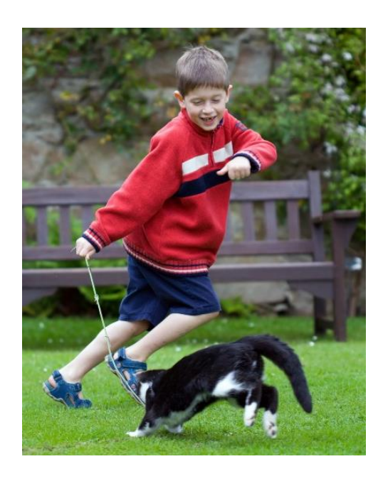
Table 2: Steps you can take to address pet obesity

promote a healthier LA County for both humans and animals alike.