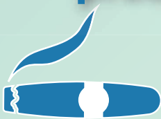
Cigars, Little Cigars/Cigarillos