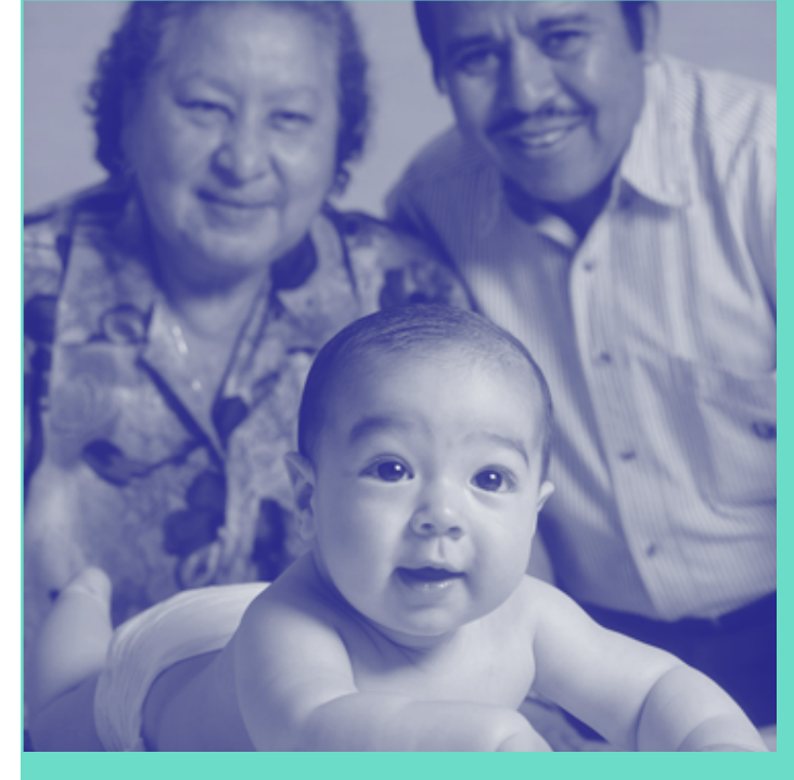
Your grandbaby needs Tummy Time! Place babies on their stomachs when they are awake and someone is watching. Tummy Time helps your grandbaby's head, neck, and shoulder muscles get stronger and helps to prevent flat spots on the head.